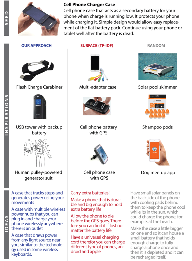
Figure 3: Overview and excerpts of the ideation experiment. Top: Seed product. Workers were asked to solve the same problem in a different way. Middle: Top 3 inspirations for each of the conditions. Note that the TF-IDF baseline returns results from the same domain, while our method returns a broader range of products. Bottom: Ideas generated by users exposed to the different conditions.

Since we used a within-subjects design, participants completed the redesign task under each of the 3 inspiration_type conditions. The order of conditions was counterbalanced to prevent order effects. To ensure unbiased permutations, we used the Fisher-Yates shuffle to assign seeds to conditions, so that every seed would be seen in all conditions (by different users).